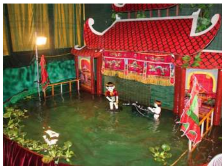
Water Puppet Performance