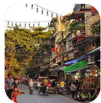
Hanoi Old Quarter