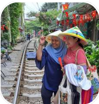
Train Street Coffee

Suggested flight: MH752 KUL HAN 09:45 12:10 or OD571 KUL HAN 10:35 12:55 (Airlines excluded)